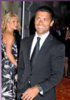
Mark Consuelos Actor/TV Personality