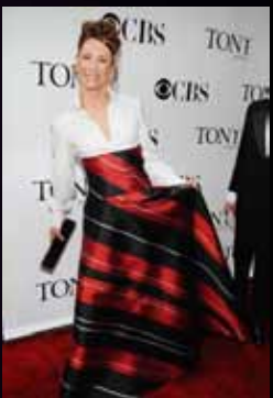
Laurie Metcalf in Edwing D'Angelo Award Winning Actress