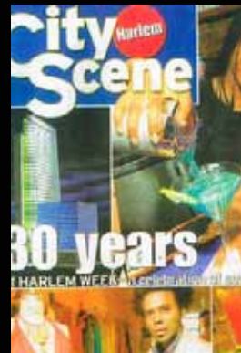
The New York Post