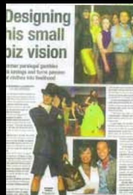
The Daily News