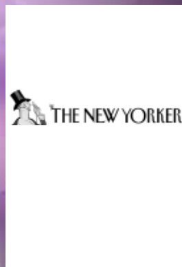
The New Yorker Magazine