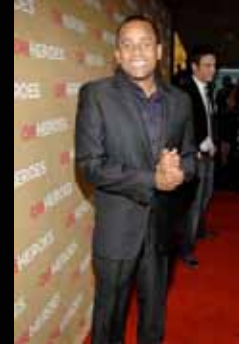
Hill Harper Actor