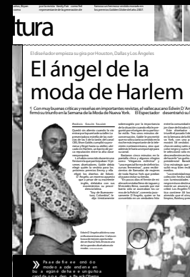
Diario La Prensa