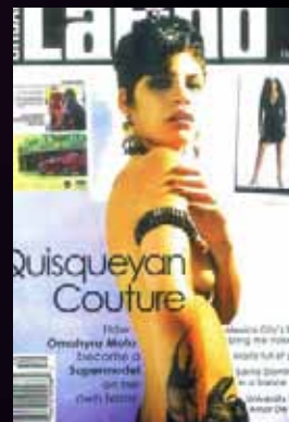
Urban Latino Magazine