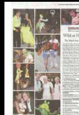
The New York Times