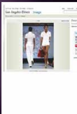
Los Angeles Times