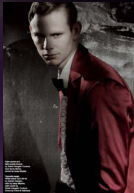
Dan Man Magazine