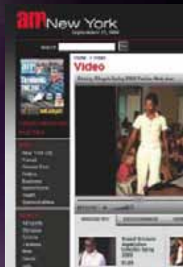
AM New York