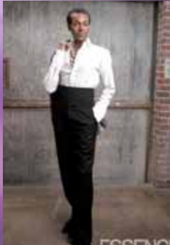
Dwight Eubanks Housewives of Atlanta