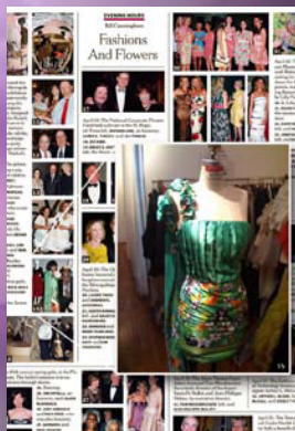
The New York Times