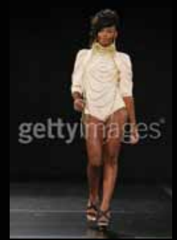
Recording Artist Dawn Richards (Diddy's Dirty Money) On the runway for Edwing D'Angelo Spring 2011 Presentation